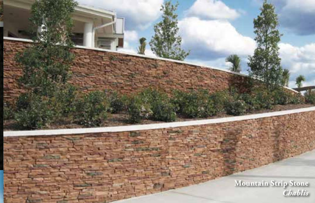
Mountain Strip Stone Chablis