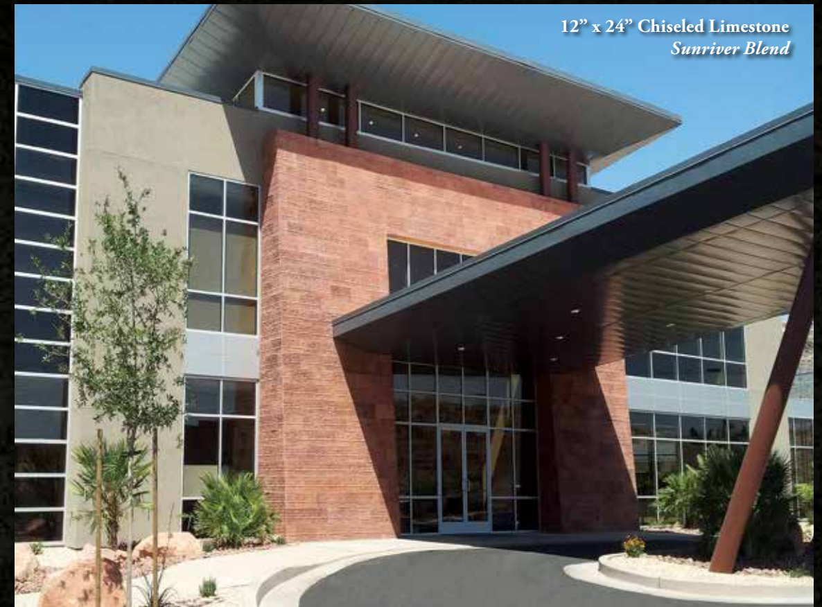
12" x 24" Chiseled Limestone Sunriver Blend