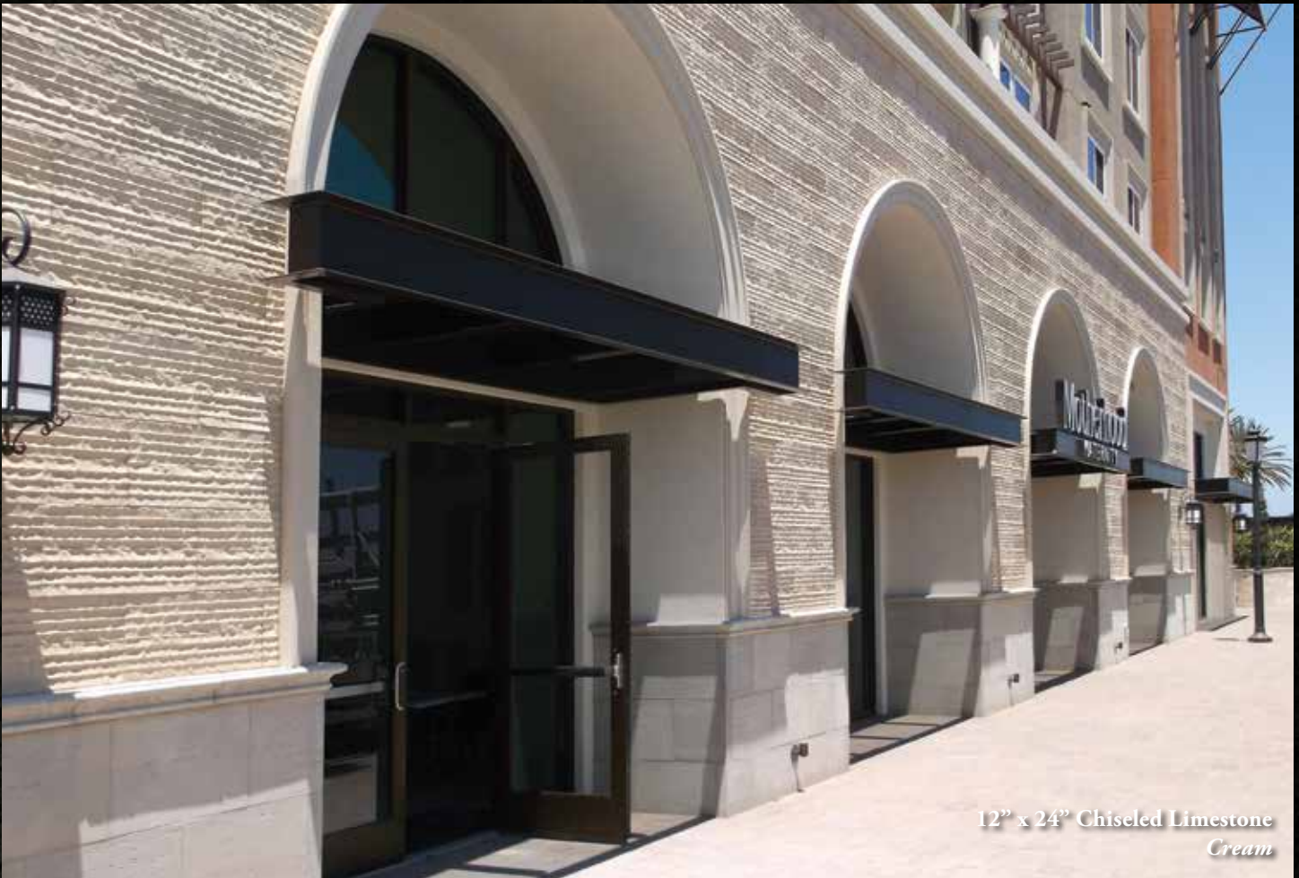
12" x 24" Chiseled Limestone Cream