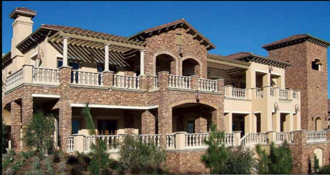
Italian Villa® Verona