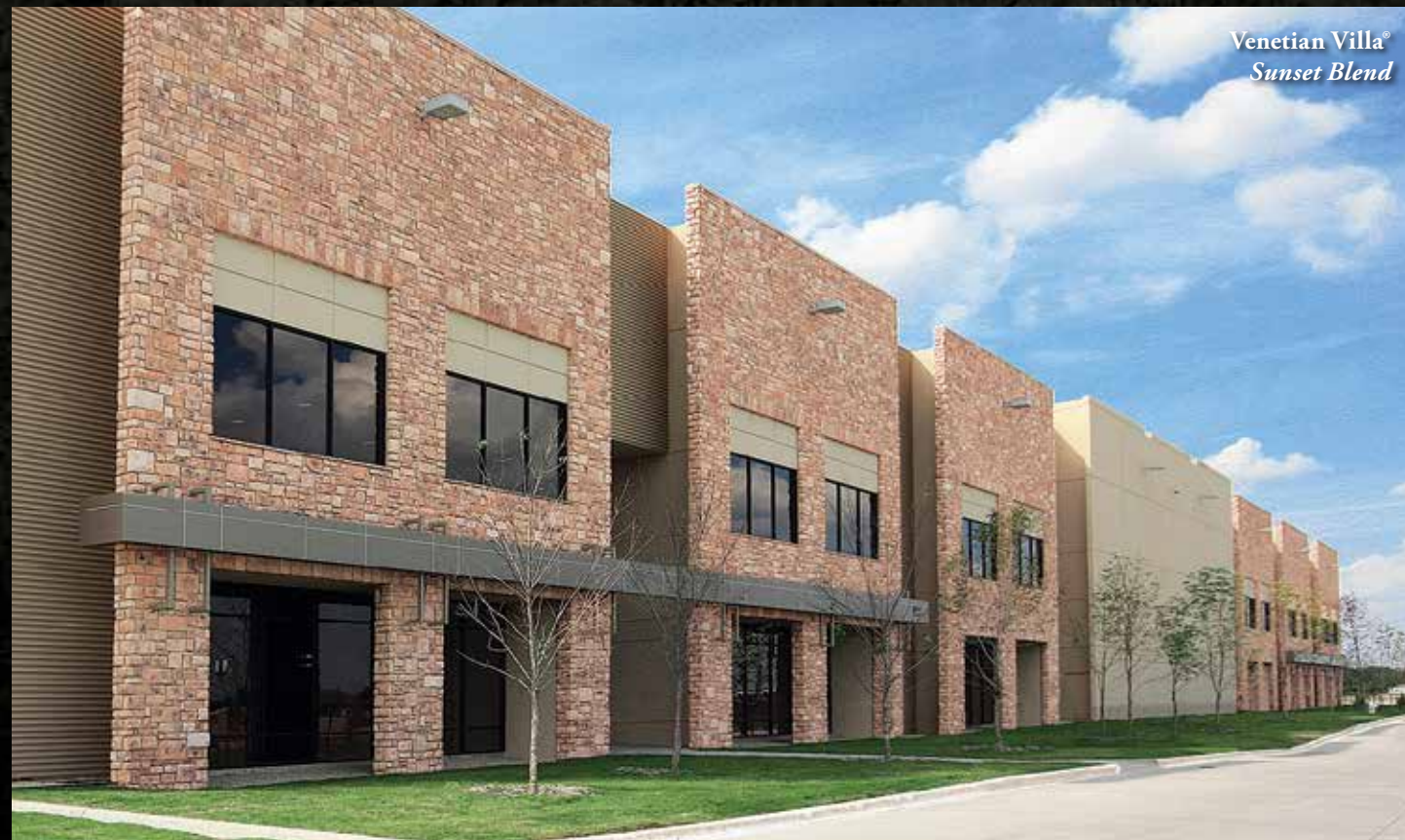
Venetian Villa® Sunset Blend