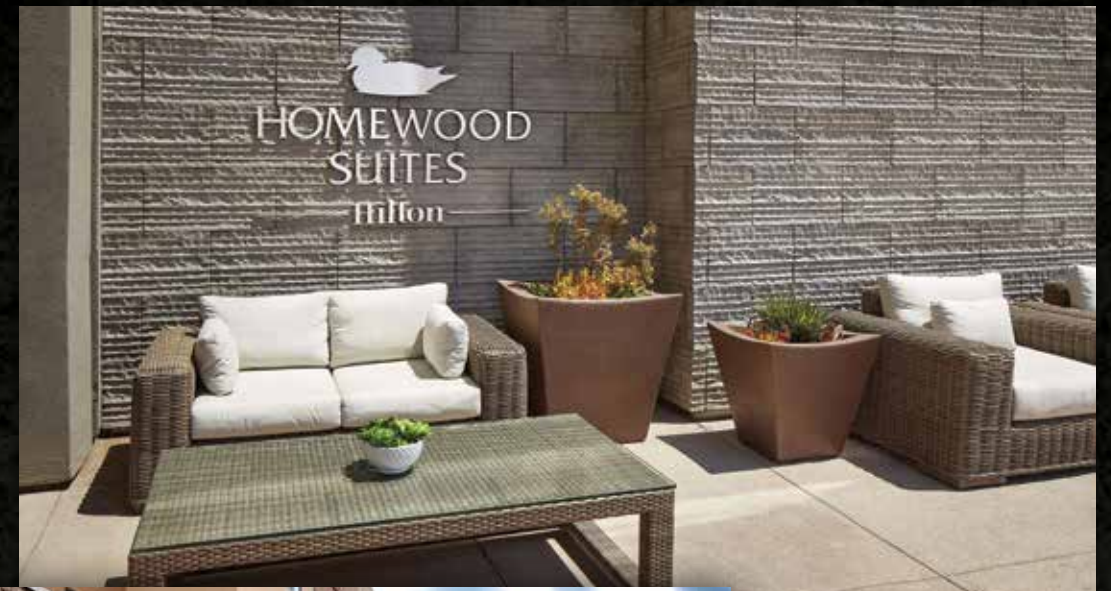
12" x 24" Chiseled Limestone Silver Ash