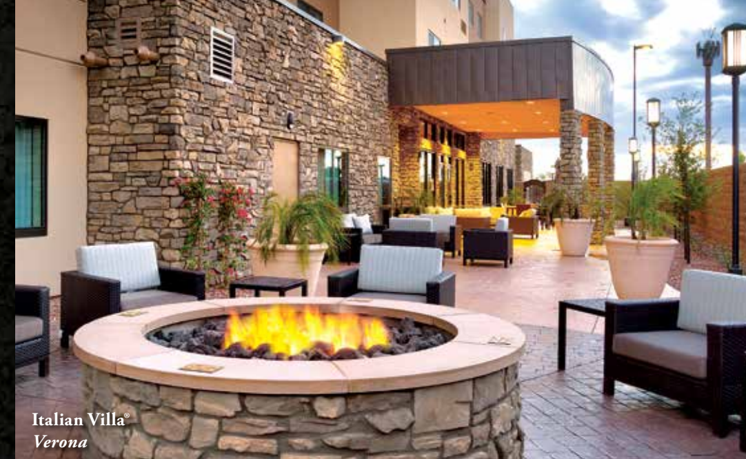
Italian Villa® Verona