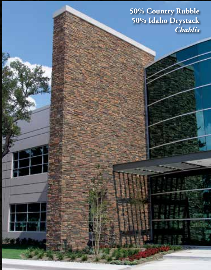
50% Country Rubble 50% Idaho Drystack Chablis