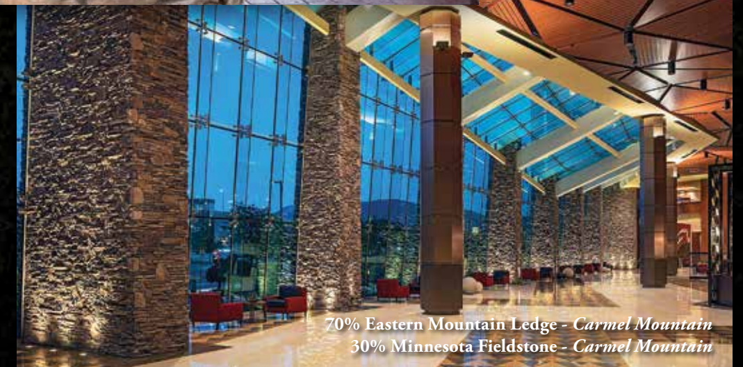
70% Eastern Mountain Ledge - Carmel Mountain 30% Minnesota Fieldstone - Carmel Mountain