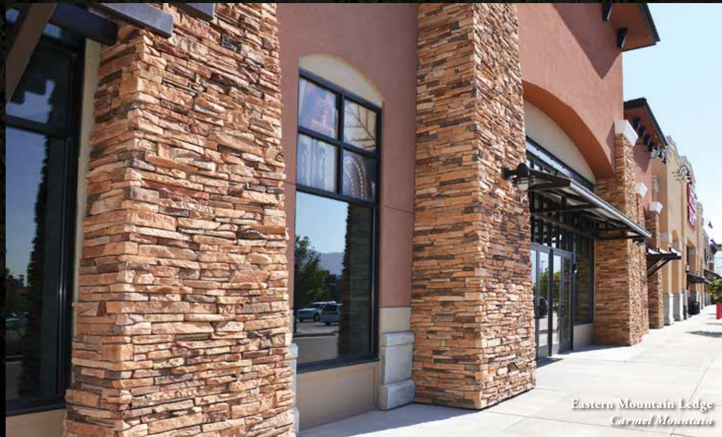
Eastern Mountain Ledge Carmel Mountain