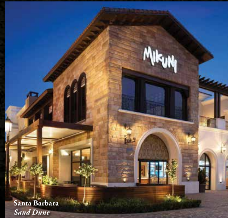
Santa Barbara Sand Dune