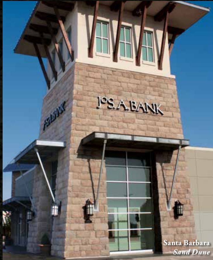
Santa Barbara Sand Dune