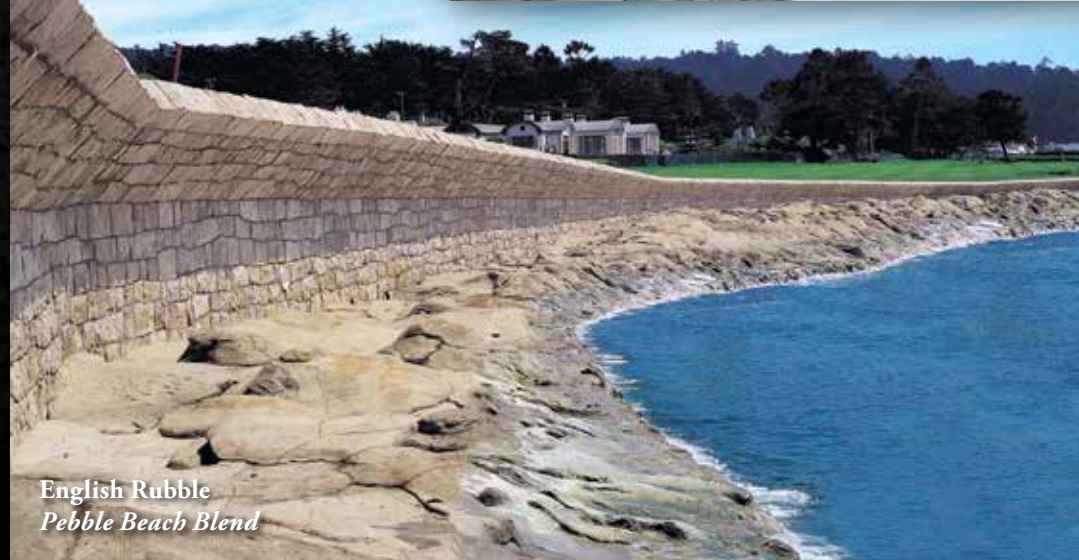
English Rubble Pebble Beach Blend