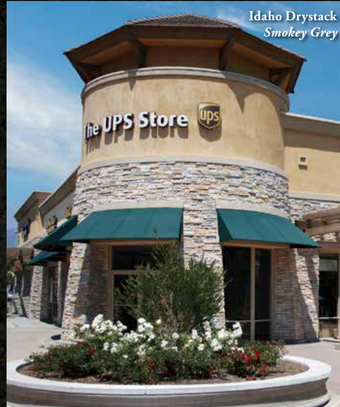
Idaho Drystack Smokey Grey