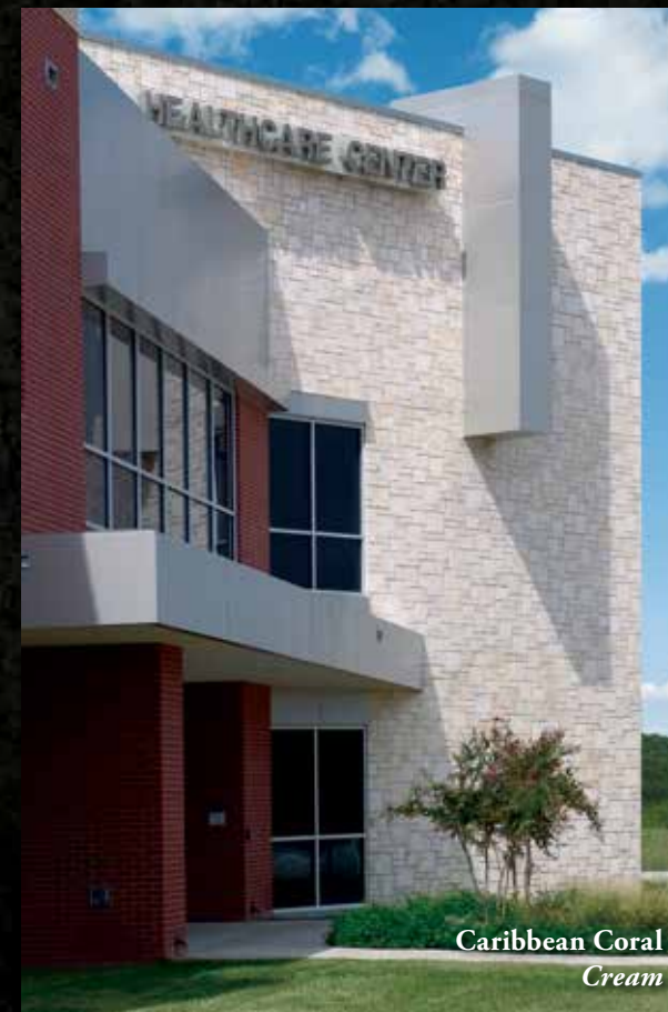
Caribbean Coral Cream