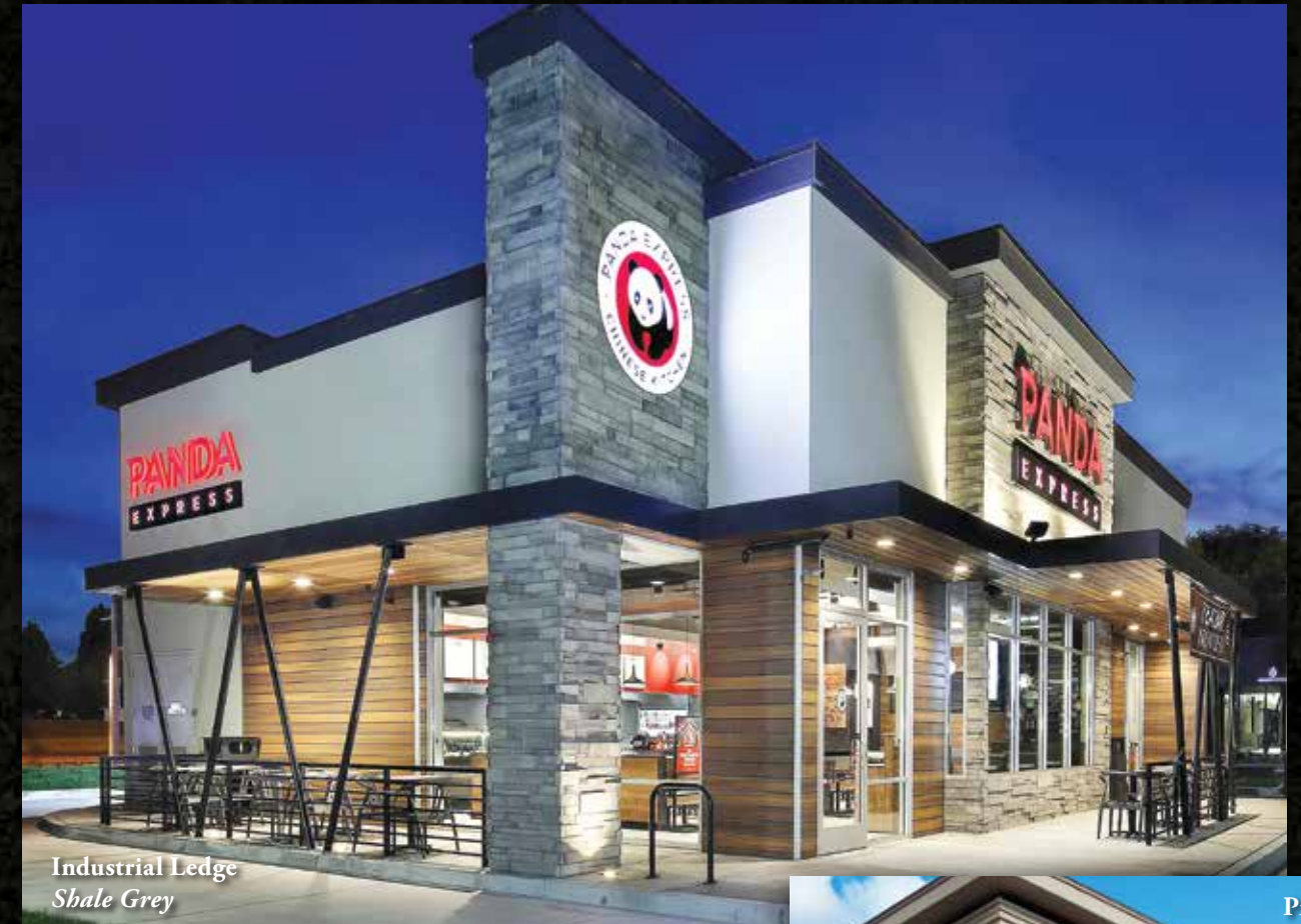
Industrial Ledge Shale Grey