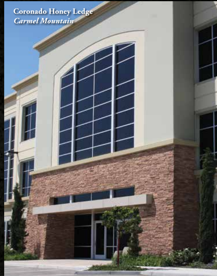
Coronado Honey Ledge Carmel Mountain